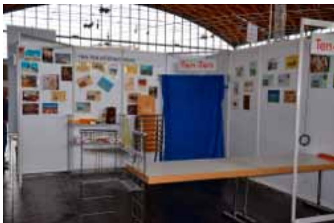
10-10 at Friedrichshafen 2013