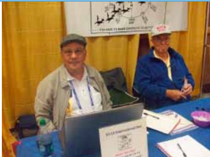
K6RDK #65812 and N0TW #36547 man the booth at Dayton. Yes it was cold this year.