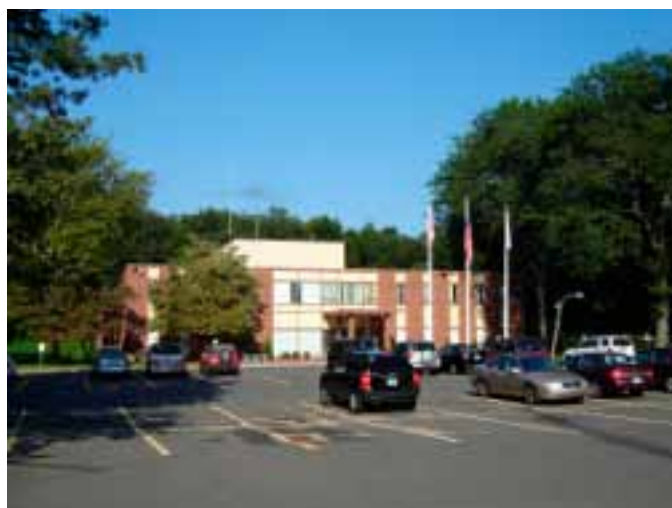
Can you Identify this building ? Hint on page 25