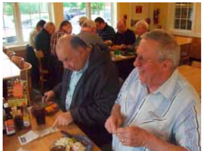
N9AVY #43313 not happy that the the President did not pay his check. Seems to be making K4QHH #26040 very happy!