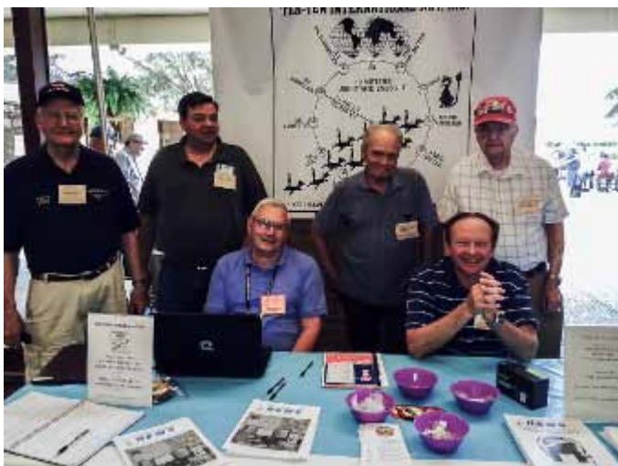
Texas Ham Com 2014

PATRIOTIC..... with station and skill always ready for service to country and community.